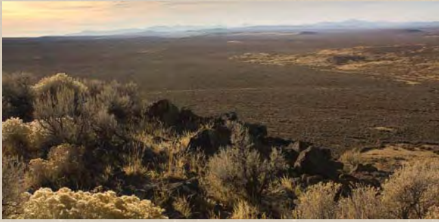
The SageSTEP Owyhee study site in Elko County, NV.