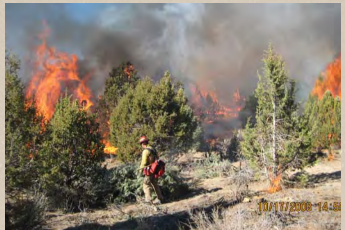
A prescribed burn was conducted at the SageSTEP South Ruby Mountains study site in Elko County, NV in the fall of 2008.

SageSTEP will be hosting a workshop for managers and other interested individuals in Winnemucca, Nevada, June 10-11, 2009. The purpose of this workshop is to provide an opportunity for scientists and managers to come together and discuss the progress of the project at the eastern sagebrush/cheatgrass and pinyon-juniper SageSTEP study sites located throughout Nevada and Idaho. We will also discuss lessons learned from working together, and plans for continued collaboration as the study progresses. A similar workshop was held in Oregon in 2008, and both managers and researchers benefitted from this interaction.