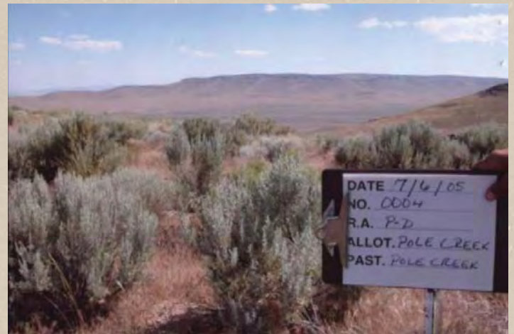
Figure 1b. This photo, taken 20 years after the Montana Fire, shows recovery of Wyoming big sagebrush, in addition to a variety of native bunchgrasses.

In the case of the Montana Fire that burned through Wyoming big sagebrush ( Artemisia tridentata ssp. wyomingensis ) in 1985, and was not seeded, cheatgrass covered the site the year after the fire (Fig. 1a). However, 20 years after the fire, monitoring plots showed an increase in cover percentages of Wyoming big sagebrush, Sandberg bluegrass ( Poa secunda ) and Thurber's Needlegras ( Achnatherum thurberianum ) and a reduction in cheatgrass (Fig. 1b). While Zielinski considers 20 years to be a relatively quick recovery time for shrubs, it is much longer than even so-called "long-term" research projects.