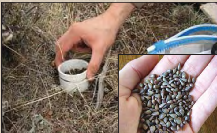
Collection of seed bank samples took place at the SageSTEP Devine Ridge and Bridge Creek sites.

Two eastern Oregon sagebrush steppe sites were chosen to represent the juniper woodland-sagebrush steppe region, the control plots of the SageSTEP Devine Ridge and Bridge Creek study sites. These sites displayed a range of western juniper canopy cover from open to closed stands. Soil samples were collected at these sites in the fall of 2006 and 2007 and subjected to both cold-wet and warm-dry stratification. Germination of the samples occurred over a period of eight months under greenhouse conditions, and then linear regression was employed to evaluate relationships.