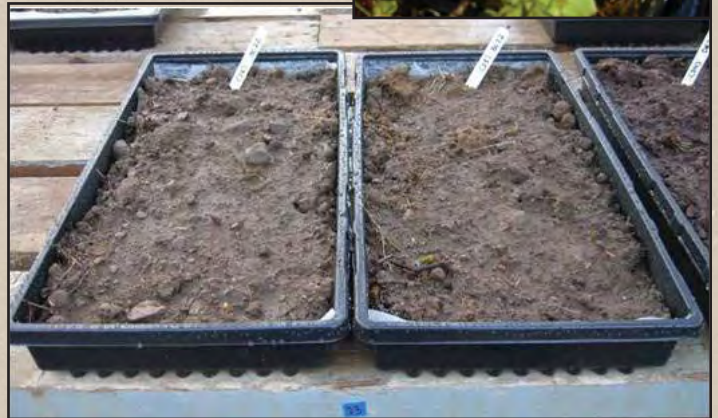
Above: Seep monkeyflower ( mimulus guttatus ) in bloom in the greenhouse. Below: Greenhouse germination of collected seeds.

During the period of this study, the degree of western juniper cover did not appear to affect ruderal species richness. However, seed density of the seed bank did appear to be affected. Positive relationships were detected at both sites during the first year of the study in which precipitation was above average. It is possible that during a wet year understory response, as measured by seed density, is greater in areas of low western juniper cover indicating that site resiliency may be higher in areas of low western juniper cover. Though three out of four related studies concur, a lengthier period of study is required to test this hypothesis.