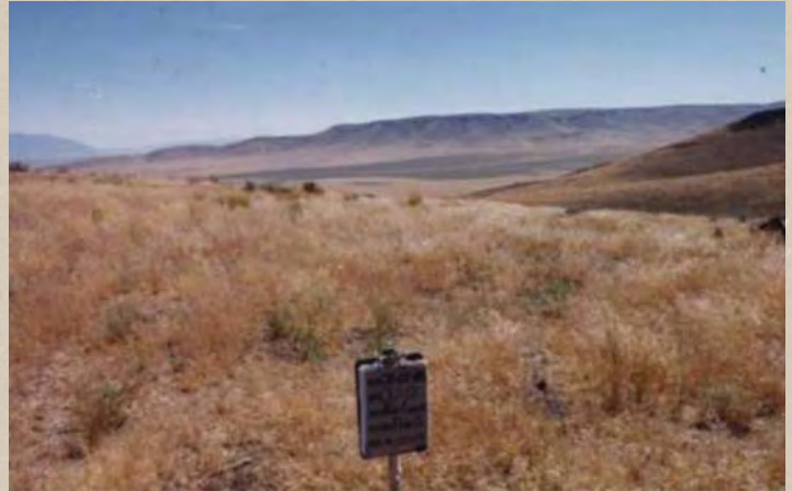
Figure 1a. Monitoring plot on the Montana Fire 1 year after burning; cheatgrass dominates the area and there are no sagebrush plants present on the site.

relatively high precipitation rates (>14 in/yr) that can support recovery. Of the 11 such burned sites that Zielinski has observed over time, 90% have recovered on their own. On the lower precipitation mountain big sagebrush sites (12-14 in/yr) and on Wyoming big sagebrush sites, recovery rates for non-seeded shrublands have been lower, though at some of these sites the shrubs have returned over time.