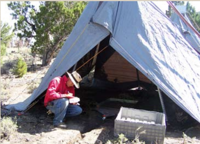
Small plot rainfall simulation at the Marking Corral site.

and erosion across a gradient of vegetation and ground cover in interspace areas and areas underneath tree and shrub canopies (coppices). Soil water repellency and ground cover factors that influence runoff and erosion are measured at each site. Pre-treatment data were collected at the Marking Corral and Onaqui sites in 2006 and serve as a baseline data set to evaluate hydrologic effects of woodland control treatments. Data collection at the Castlehead site began in May of 2008. This article presents preliminary results from the 2006 pre-treatment data collected at the Marking Corral and Onaqui study sites.