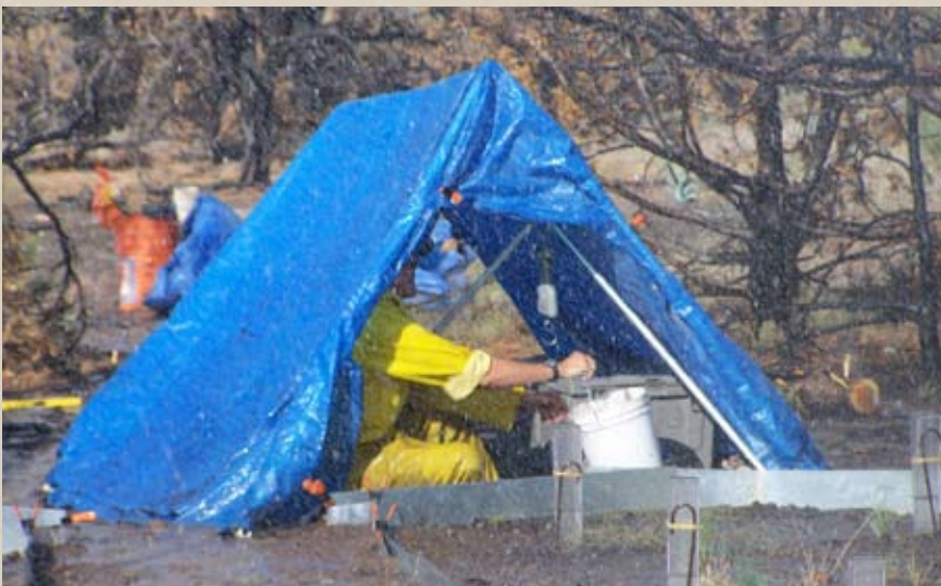
Runoff and sediment sampling on large rainfall simulation plot.

Hydrologic experiments are being conducted at one western juniper (Castlehead, ID), one Utah juniper (Onaqui, UT), and one pinyon-Utah juniper (Marking Corral, NV) site within the greater SageSTEP study area (see map on p.5). Experiments are implemented within woodland areas prior to tree removal (pre-treatment) and within areas that have been treated by burning, cutting and bullhog tree removal methods. Artificial rainfall simulations at the small (0.5 m 2 ) and large plot (13 m 2 ) scales, and concentrated flow experiments are being used to quantify runoff