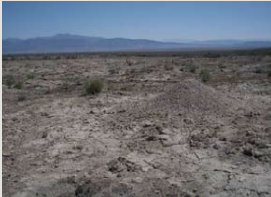
Ant nest on Onaqui burn plot.

The researchers are looking at how ant foraging behavior, fate of ant-collected seeds, and seedling establishment with and without harvester ants are influenced by cheatgrass density and management treatment. This study is being conducted at the SageSTEP Onaqui sagebrush/cheatgrass study site, which includes four management treatments on 75-acre plots: prescribed burn, mechanical thinning (mowing), herbicide (tebuthiuron), and control. Western harvester ant ( Pogonomyrmex occidentalis ) colonies have been selected throughout the plots at various cheatgrass densities (low, medium, high) and across the range of treatments. Data collection began in 2006 and will continue until 2010 and takes place twice a season (early June and late July).