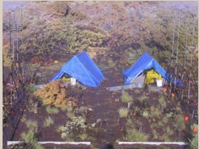
Large plot rainfall simulation after tree cutting at the Marking Corral site.

Runoff and erosion at the large plot scale were greater from shrub-interspace (varying amounts of shrub and interspace areas) than tree patches (area under trees with varying amounts of interspace area). Greater average runoff rates are related to greater proportions of interspace to coppice area within shrub-interspace patches. Tree coppice mounds cover a larger surface area than shrub coppices and have greater litter depths. These data indicate tree patches have greater rainfall storage and/or infiltration