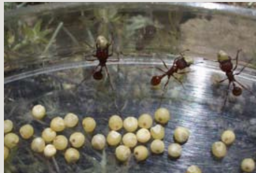
Western harvester ants ( Pogonomyrmex occidentalis) removing millet from a seed tray in a seed-removal trial.