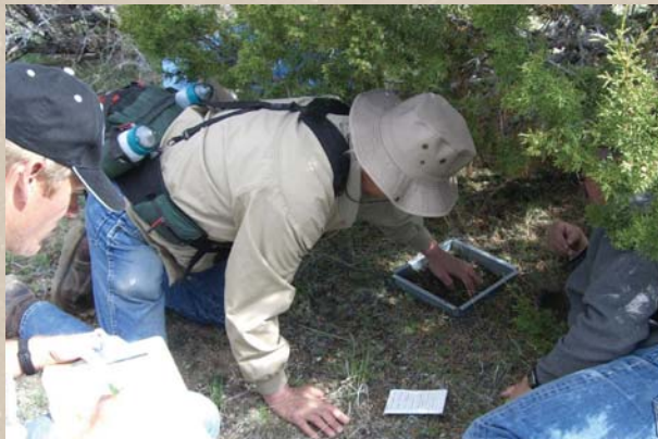
Collecting data at a woodland site.