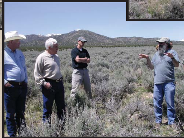
Field tour at Onaqui site with Utah Partners for Conservation and Development, April 2006.