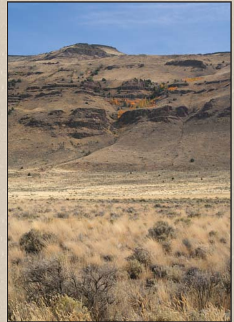
Hart Mountain Sagebrush/ Cheatgrass Site, Oregon

We will be sending out our newsletter approximately three times a year with updates and information about the progress of the project. The SageSTEP research team is excited to undertake this project and we look forward to providing interested land managers and stakeholders with useful information for the future of sagebrush steppe ecosystems.