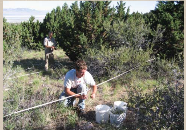
Collecting data at a woodland site.

Vegetation will be measured in each subplot in the form of cover by species, basal gap analysis of perennial plants, shrub density by height class, and herbaceous density by growth form.