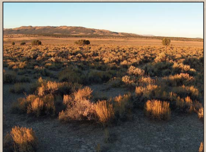
Spruce Mountain Sagebrush/Pinyon-Juniper Site, Nevada