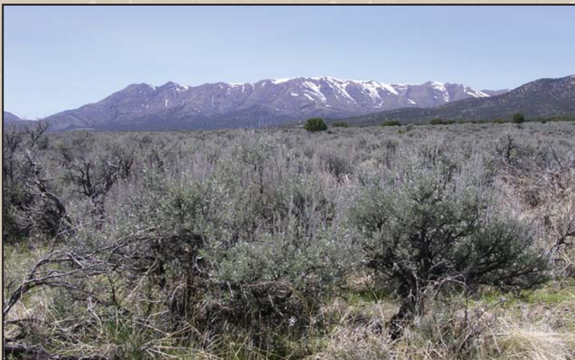
Onaqui Sagebrush/Utah Juniper Site, Utah