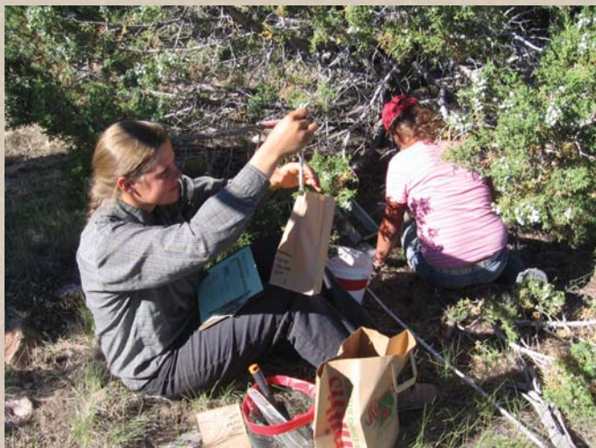
Field technicians collect samples.

Sites in California and Idaho will not be treated until fall of 2007, and the majority of baseline data for these sites will be collected in the summer of 2007. For more detailed information about baseline data collection, please contact the relevant discipline group leader. Names and contact information can be found on our website at www.sagestep.org/team_members.html .