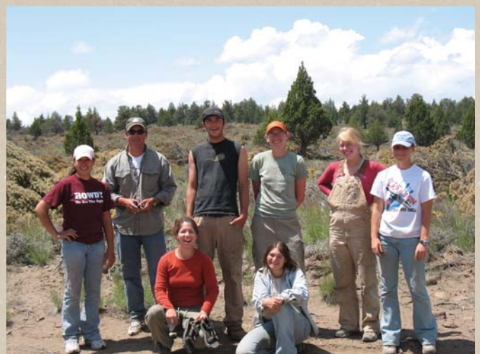
Sagebrush/Western Juniper Field Crew